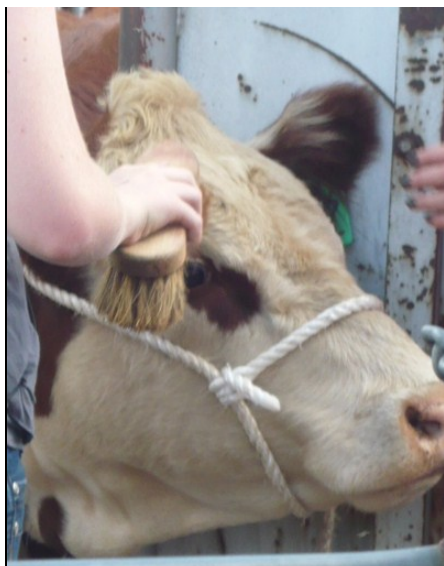
Hereford heifer being brushed