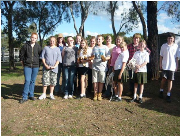
Ag Club 2014