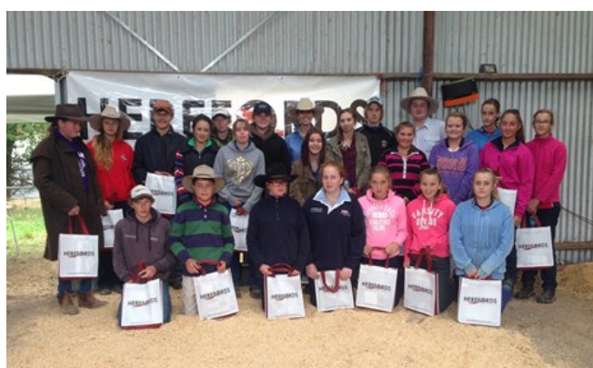
All the Junior workshop course participants