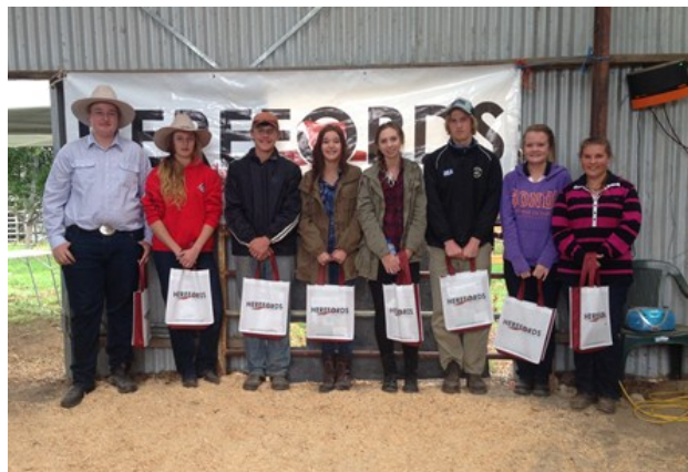
The Mulwaree High workshop course participants

On Saturday March 1 st , 8 students (plus Miss Heath & Mrs Holmes) attended a Herefords workshop on showing and judging cattle. Even though it was rainy and not as 'hands-on' as planned, it was great to learn from experts in the field: and great to work with such beautiful animals. We learned lots about what judges are looking for in a top bull/ heifer or cow and we also learned a lot about what the judges are looking for from the students who are parading the cattle. We were amazed by the amount of 'product' that goes into getting the animals hair shiny and lustrous for the day!! We learned lots about blowing and brushing too! We now just have to encourage the Ag Club and the Junior classes to keep working with our Herefords to get them used to being handled so that they can start being led. And they are getting there!