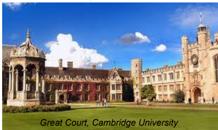
Great Court, Cambridge University

A scene in the film recreates the Great Court Run in which the runners attempt to run around the perimeter of the Great Court at Trinity College, Cambridge, England in the time it takes the clock to strike 12 at midday. The film shows one of the main characters performing the feat for the first time in history.