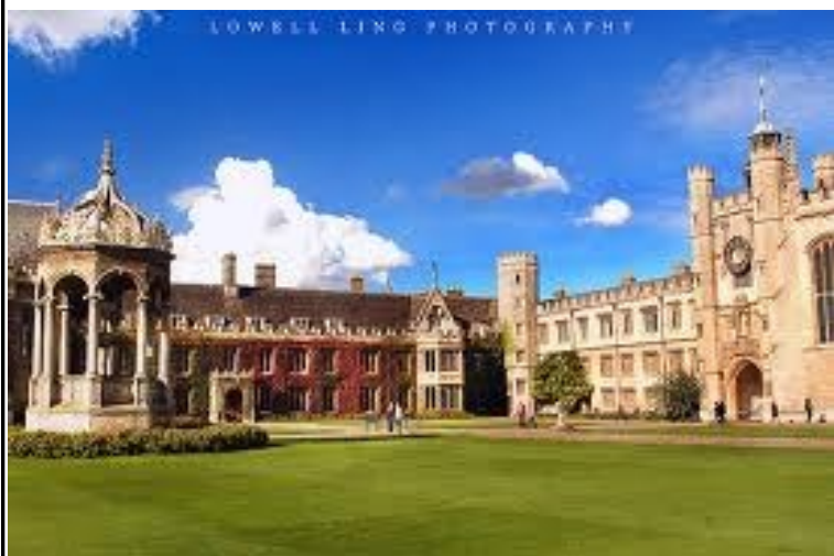
Great Court, Cambridge University

A scene in the film recreates the Great Court Run , in which the runners attempt to run around the perimeter of the Great Court at Trinity College, Cambridge, England in the time it takes the clock to strike 12 at midday. The film shows one of the main characters performing the feat for the first time in history.